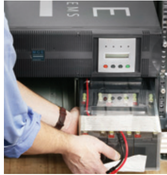
Clear coat battery packaging with thru-holes for diagnostics and testing