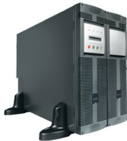
Versatile form factor