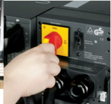
Hot-swappable I/O Box