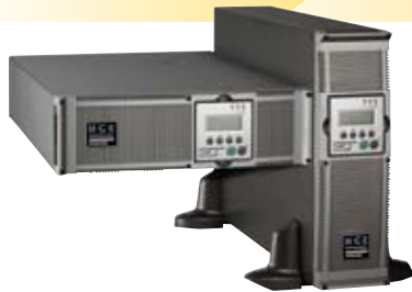
Pulsar MX RT 5 kVA 4.5 kW