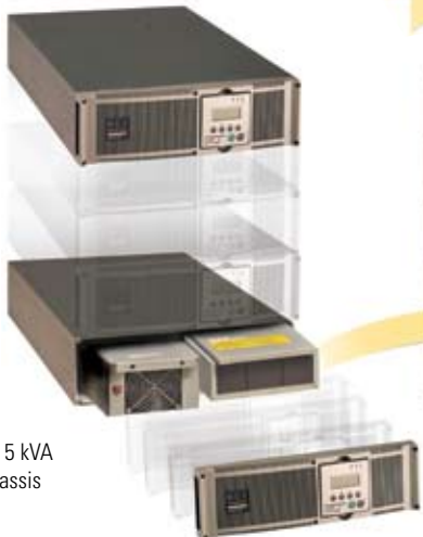
Standalone 5 kVA MX 3U chassis