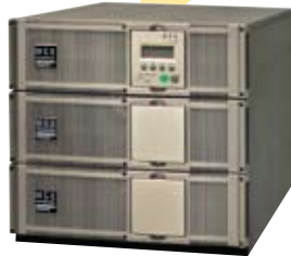
MX 10U Frame 5 kVA 4.5 kW 10 kVA 9 kW