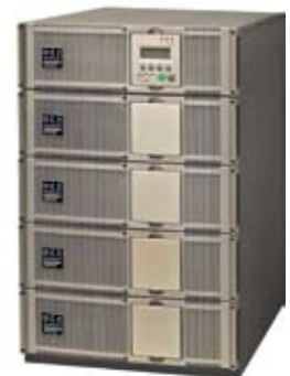
Fully assembled 20 kVA 16U Frame

Add POWER AND BATTERY SUB-MODULES to complete a 20 kVA 16U Frame