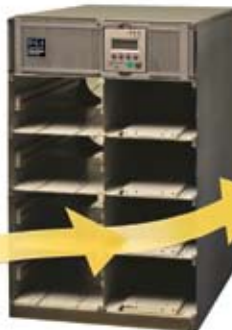
20 kVA 16U Frame